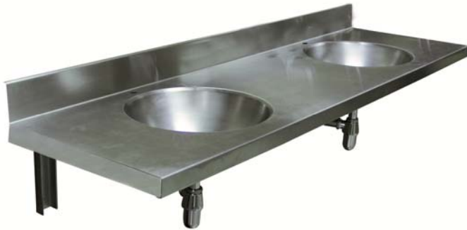
The picture belongs to 13070.3.S